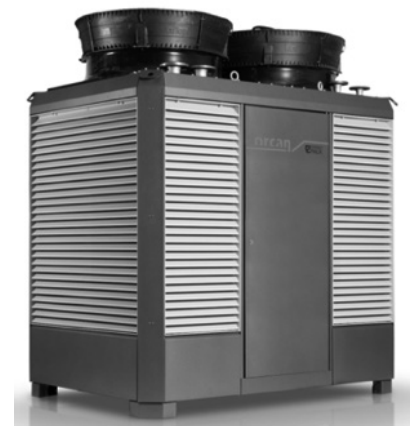
Figure 1: efficiency PACK eP 20.30 (20 to 30 kW), which is also protected by a registered design right.