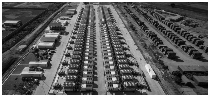
Figure 2: aerial view of the installation in Myanmar: with 90 MW electricity produced by 70 gas engines each combined with an ORC from Orcan.