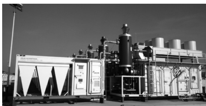
Figure 3: close-up of the installation in Myanmar. Each of the 70 units consists of a 1.5 MW gas engine (right-hand side with six cooling funnels on top). The component in the middle is the heat exchanger that transfers heat from the exhaust of the gas engine to the ORC on the left-hand side. This Myanmar installation comprises 70 gas engines producing 90 MW electricity from natural gas. The heat of the exhaust gas (approximately 400°C) is transferred to an intermediate water circuit (150°C), which then goes into the ORC (indirect system). Orcan's generators can produce an additional 5 MW, saving 8–9 million m3 of natural gas per year and contributing to emission-free electricity for around 120,000 people.

It was quite a journey for Orcan from the small early efficiency Pack (20-30kW), individually sold and installed on single sites, to these large energy parks that have a significant economic and ecological impact.