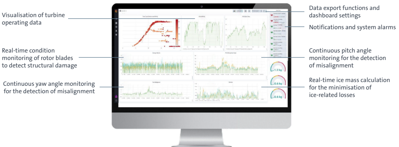
Figure 2: retroX dashboard