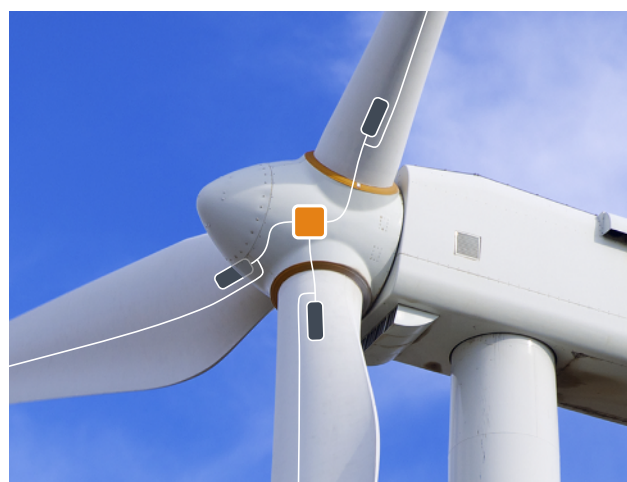
Figure 1: Blade load monitoring on wind turbine rotor blades

The solution was to change from electrical to optical sensors that send out white light (whole spectrum) in a glass fibre fixed to the rotor blade. After hitting a fibre Bragg grating (inscribed in the optical fibre) only light with a certain wavelength is reflected and measured. A load applied to the rotor blade will change the wavelength of the reflected light. By measuring this shift in the wavelength, the load applied to the blade at this area can be measured. Only a small number of sensors (between two and five) are needed per blade, with the sensors themselves being easy to install.